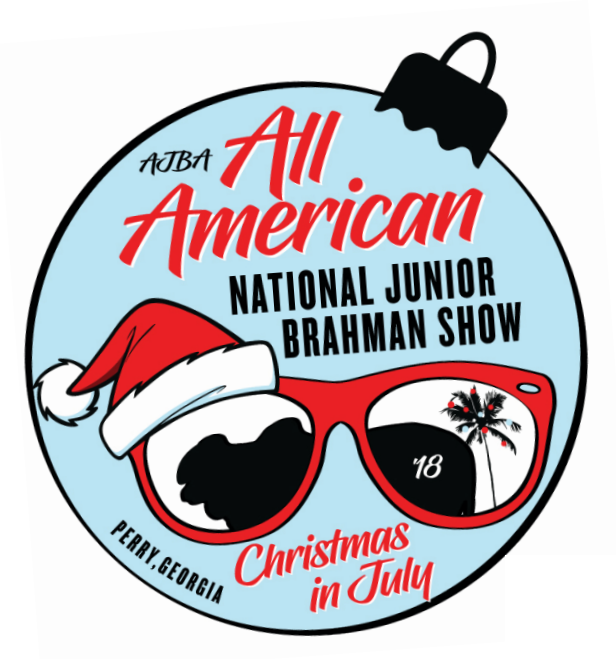
Page 15 | 2018 All American Entry Packet • Perry, Georgia • July 1-7, 2018

23. Private Sales: No private sales will be held at the "All American". No promotion of private sales or ranch promotion is permitted EXCEPT for the recognition given by the AJBA to their sponsors.